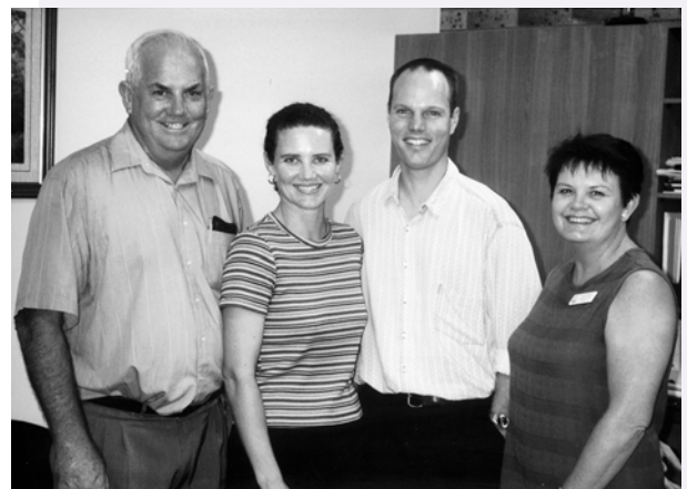
Some members of a collaborative team consisting of Principal, Wrap Around Co-ordinator, GP and Psychologist (Speech Pathologist absent)

We found that assembling a team of health professionals to meet with the parent(s) and the class teacher(s) improved communication between home and school and increased understanding of the individual needs of the child.